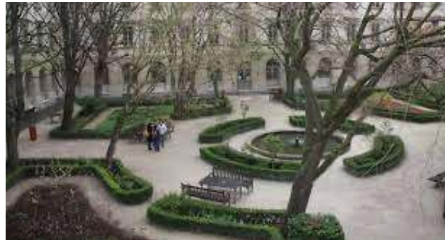
ENS's historical building in downtown Paris

Students enter there after 2 ou 3 years of higher education